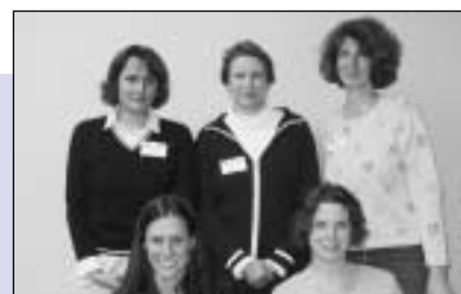
Panel 4 – Health Education, Prevention & Treatment Services