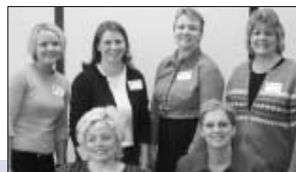
Panel 1 – Effects of Unemployment & Underemployment